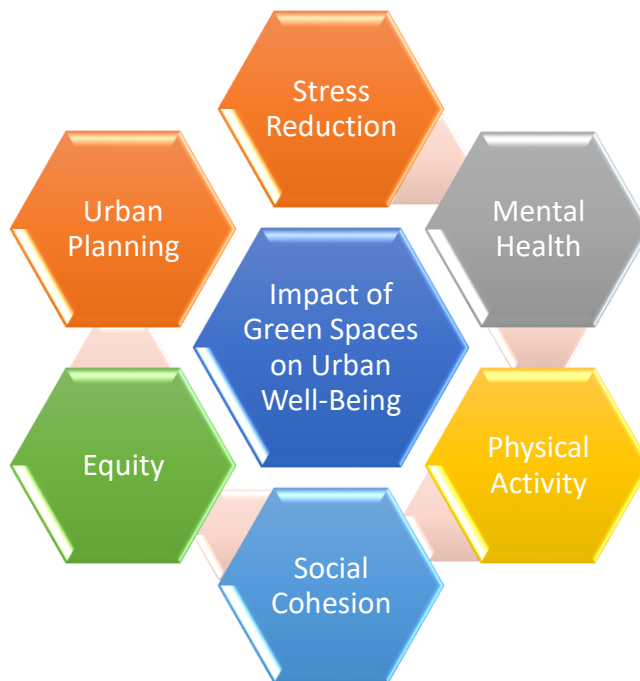
Figure 3 Key Benefits of Green Spaces for Urban Well-Being

Figure 3 shows the key benefits of green spaces in urban environments and their role in enhancing well-being. It highlights six interconnected factors: stress reduction, mental health improvement, physical activity, social cohesion, equity, and urban planning. Together, these factors emphasize the importance of green spaces in fostering sustainable and healthy urban living.